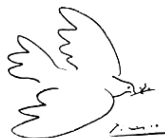
Picasso Peace Dove